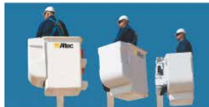
180 degree platform rotator